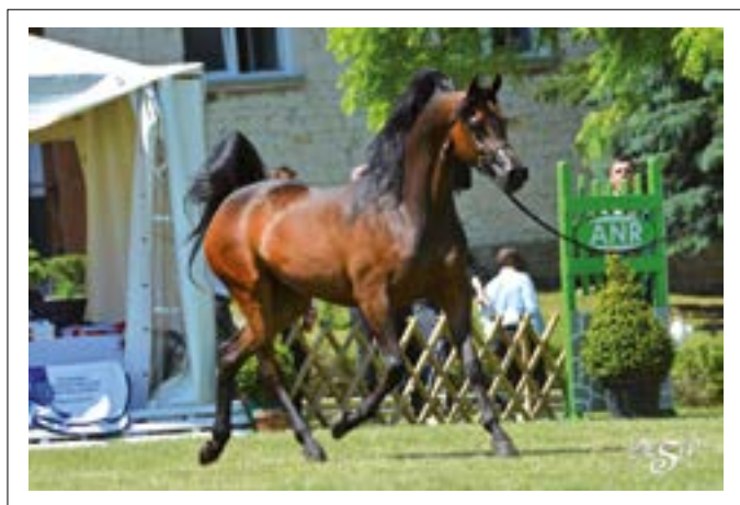
II place „Pustynia Kahila”