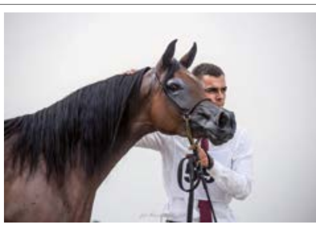
III place „Wieża Nimf”